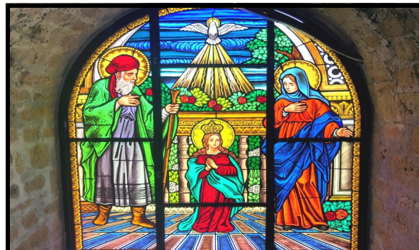
Entrance Through The Marian Hall

OUR LADY OF BARRENSPOT SHRINE Located In The Sugar Mill - Erected 1808